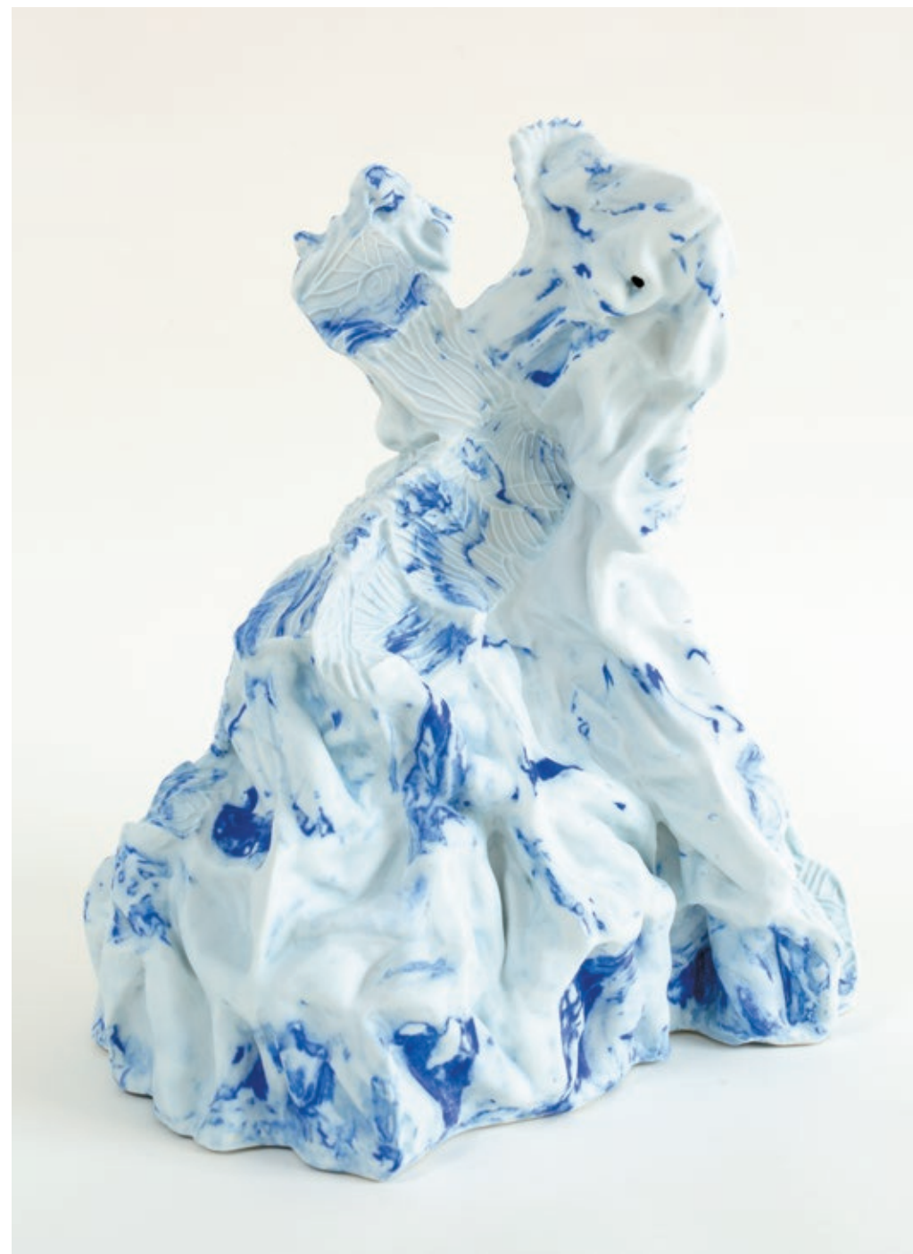
Right: Liquid Landscape, 2018 Porcelain, pigments and glaze, 44H x 37W x 30D cm