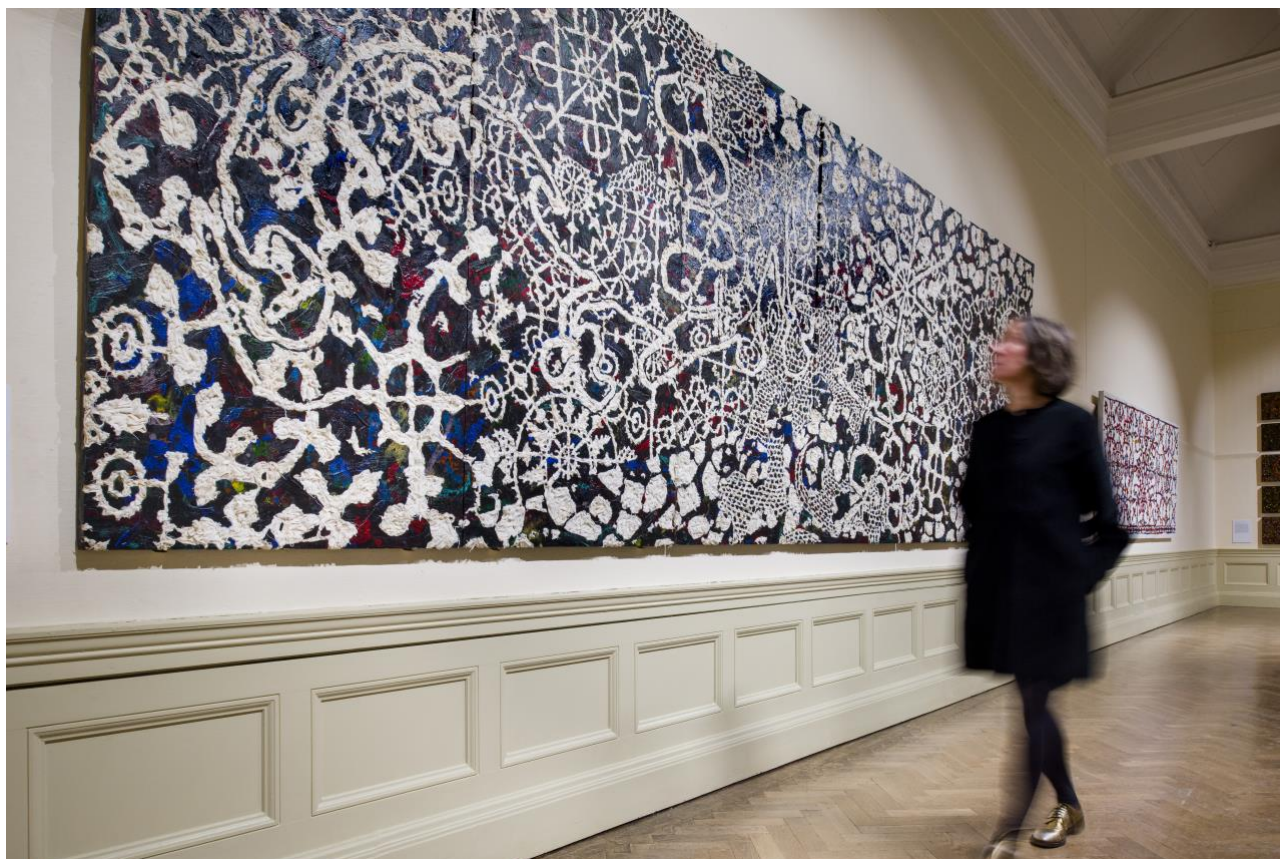
Installation image of Field of Centres, 1996 in the exhibition The Encirclement of Space at the Williamson Museum in Liverpool 2023. Now to be found in the collection of Calderdale Museums and Arts (UK)